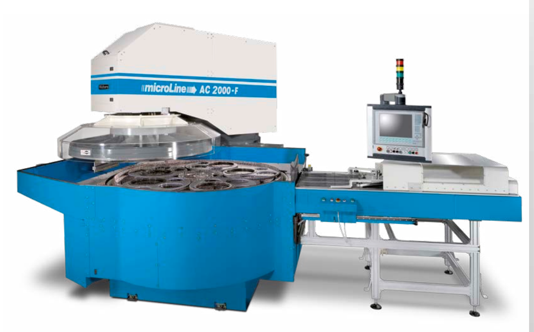
AC 2000-F with carrier loading system (optional)

PETER WOLTERS AC 2000 double-side batch processing machine has been designed for high-precision series processing work pieces. Due to its modular construction, AC 2000 can be used as a fine grinding, lapping, honing, and polishing machine.