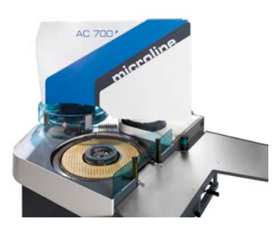
Front view into open machine