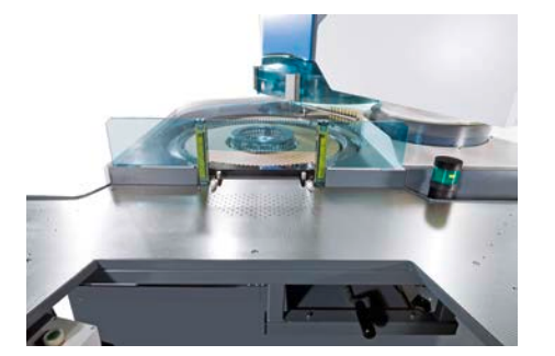
View via loading bridge into the working area

LAPMASTER WOLTERS Buesumer Str. 96 • 24768 Rendsburg, Germany Phone: +49 (0) 4331/458-0 • info@lapmaster-wolters.de