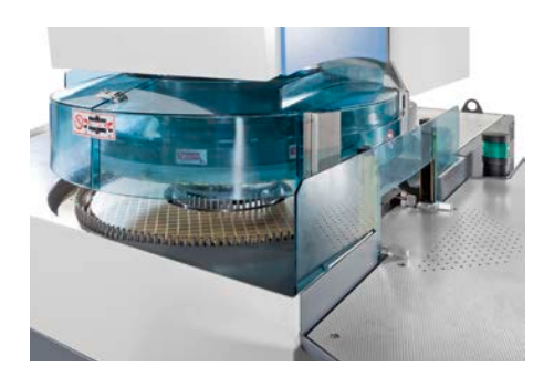
Side view with loading table