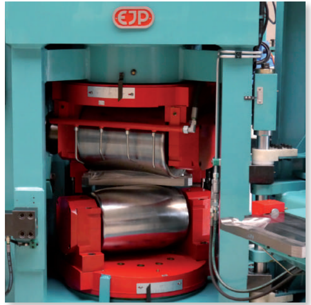
Straightening rolls for bright material